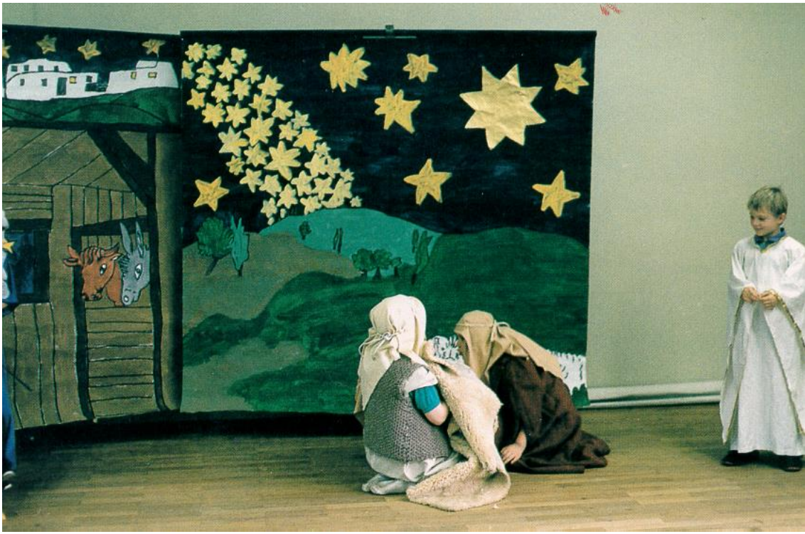
The angel appears to the shepherds.