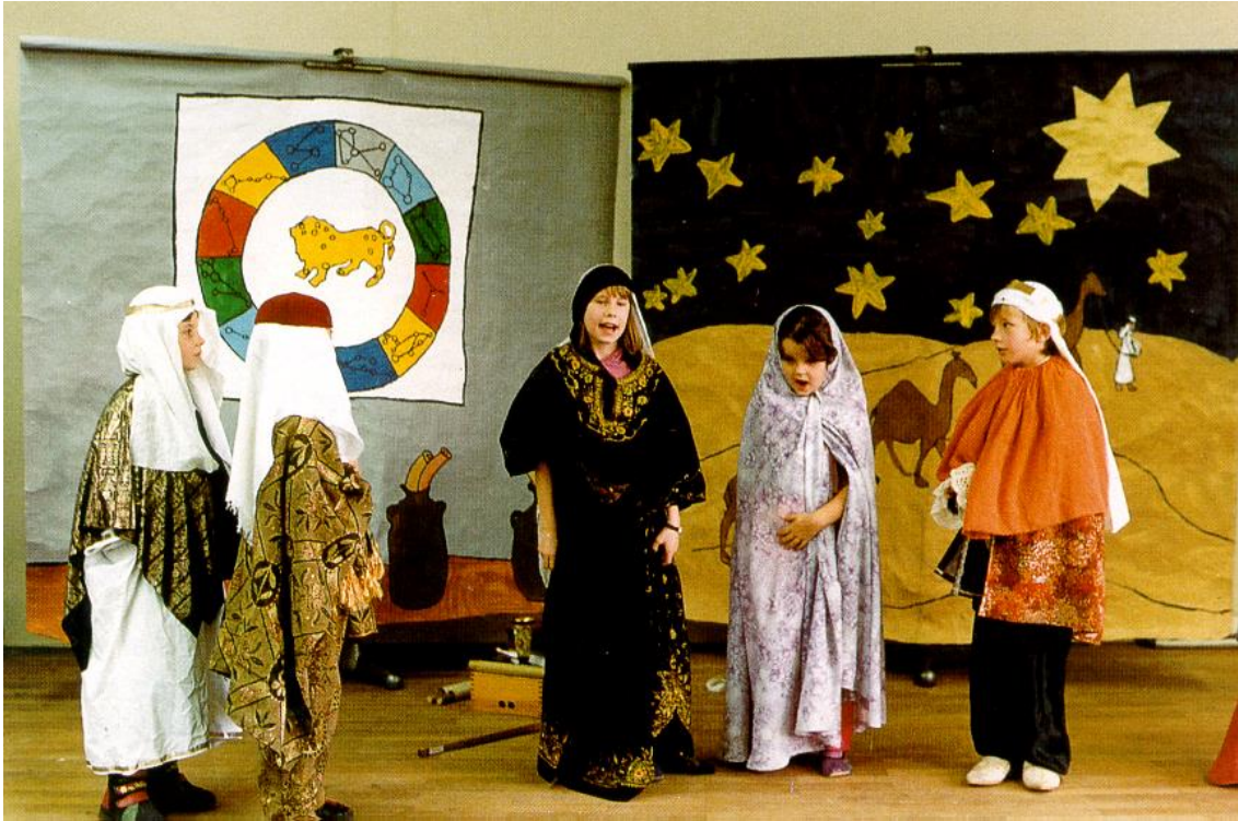
The women of the wise men talk about the new bright star on the western sky.