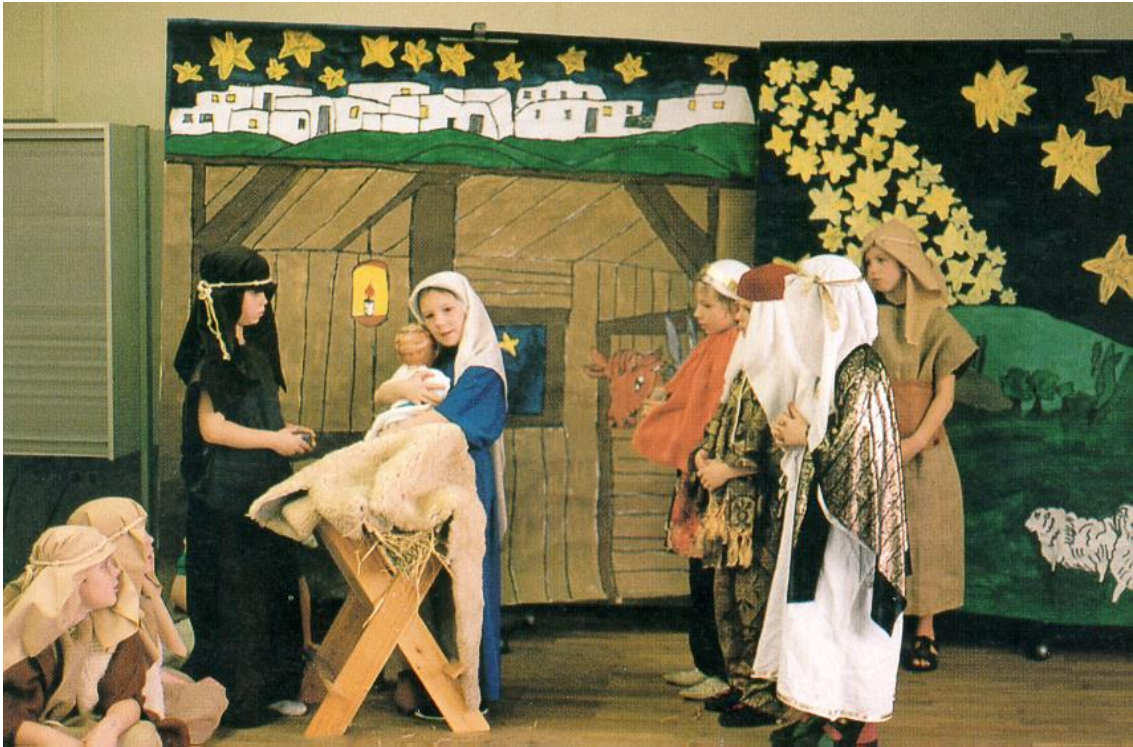
Mary learns, about the danger for her child.