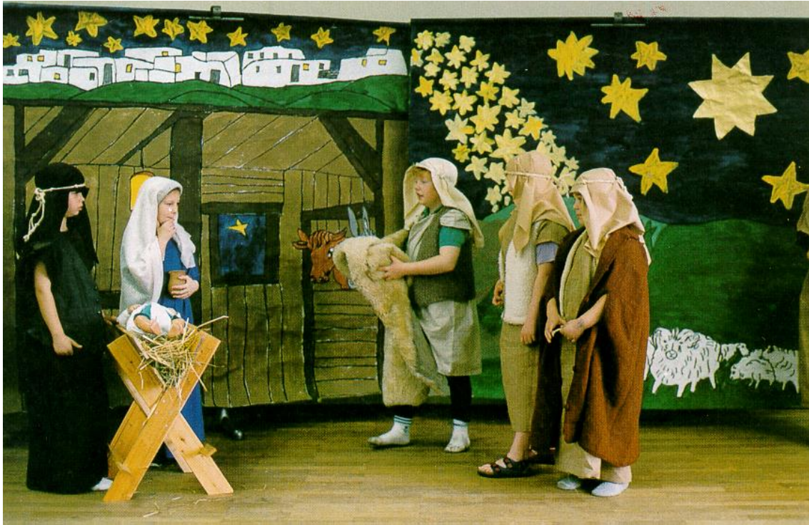
The shepherds present their gifts.