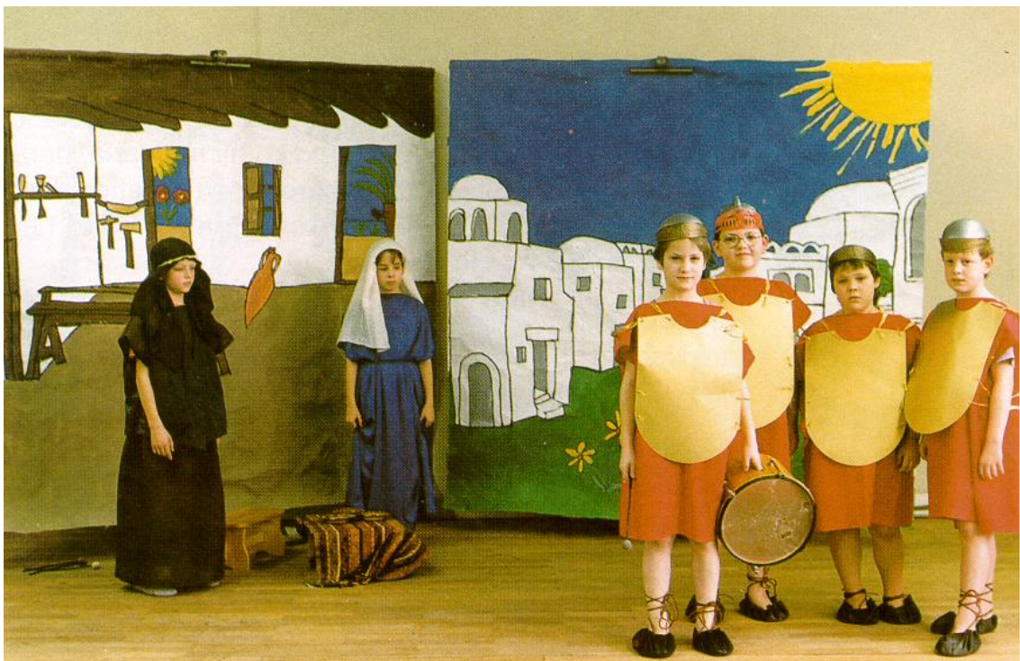
A troop of Roman soldiers appears in front of the house of Mary and Joseph.