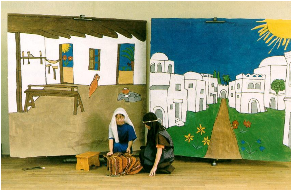
Mary tells Joseph about the angel that had appeared to her.