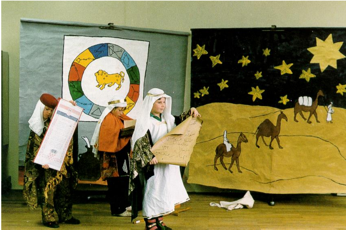
The wise men in the observatory in Persia, reading in old scrolls.