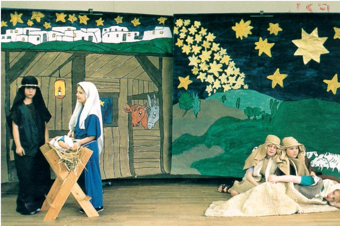
Mary and Joseph and the shepherds in Bethlehem.