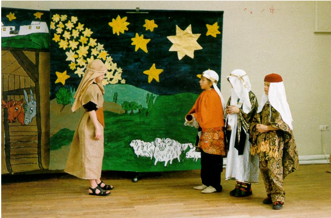
The wise men appear and talk with the host.