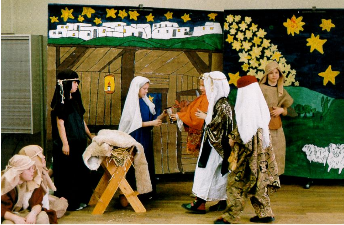
The wise men present their gifts.