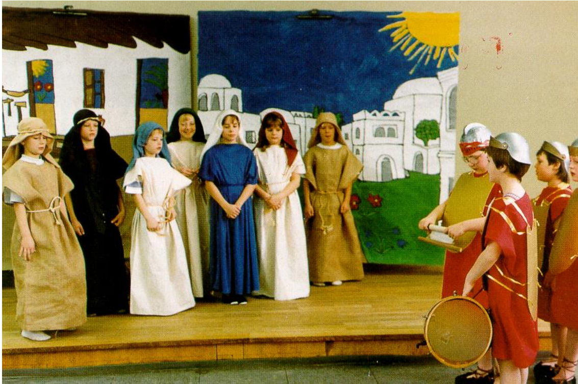
The soldiers announce the demand of the Emperor Augustus.