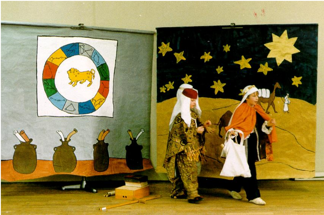
The wise men start their journey to Jerusalem.